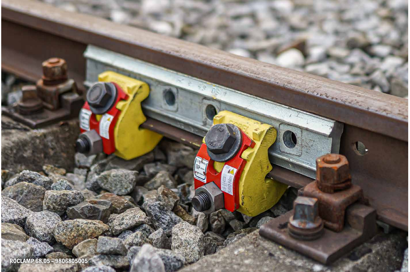
ROCLAMP 68.05 - 9806805005

For a safe and reliable connection of two rail ends. For insulated rail joints, rail breaks, and detected rail defects. From prevention to repair. In use worldwide.