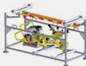
Transport frame - 7738960001