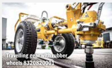
Travelling gear with rubber wheels 8320820001