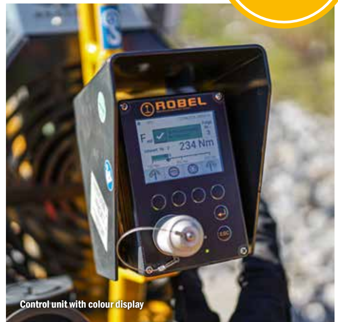
Control unit with colour display