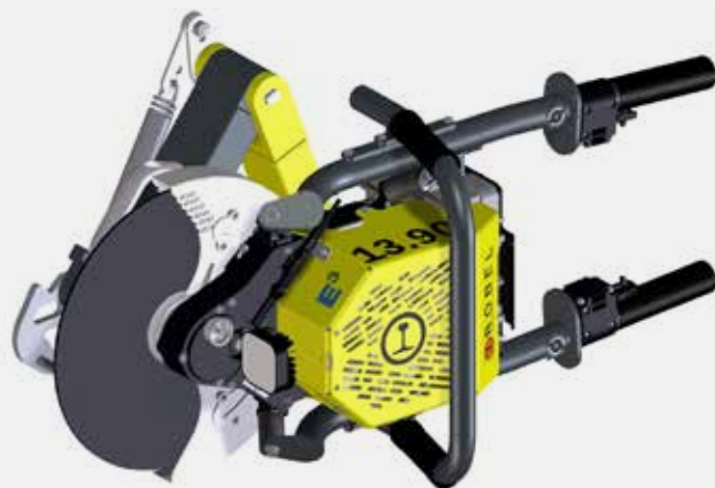
ROCUT 13.90 – 5909900008