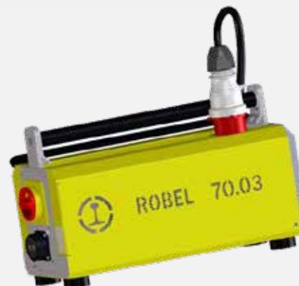
400 Volt power supply – 5039900003