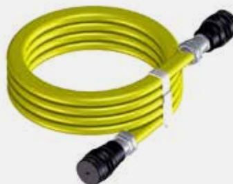
Connecting cable – 5016060210