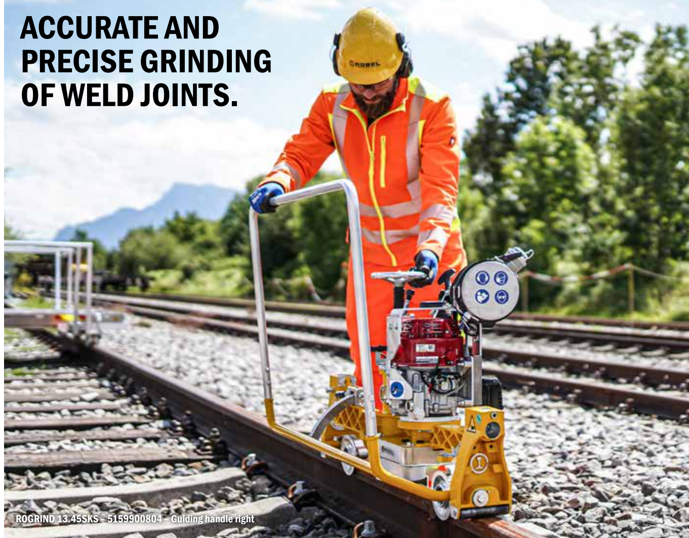
ROGRIND 13.45SKS - 5159900804 - Guiding handle right

The grinding machine for reprofiling the rail head.