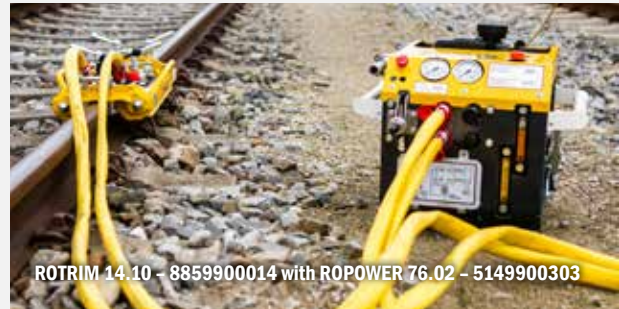
ROTRIM 14.10 – 8859900014 with ROPOWER 76.02 – 5149900303