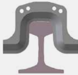
Shear blade FORM A (with riser)