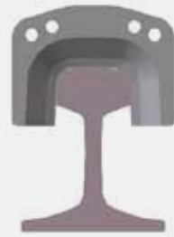
Shear blade FORM B