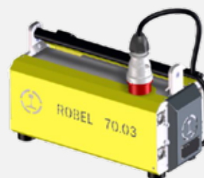
400 Volt power supply – 5039900003

We will be happy to convert your machine in Freilassing. You are interested in purchasing a new battery powered machine? Please get in touch with your ROBEL contact for further information.