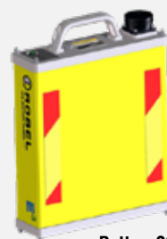
Battery 2300 Wh – 7839900001