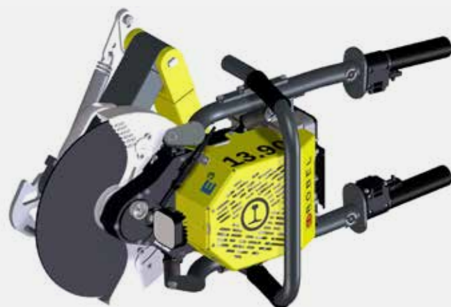
ROCUT 13.90 – 5909900008