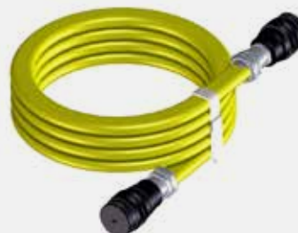
Connecting cable – 5016060210