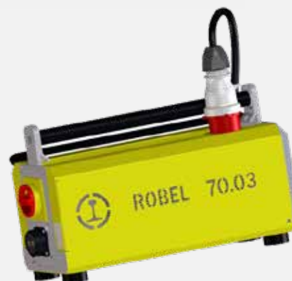
400 Volt power supply – 5039900003