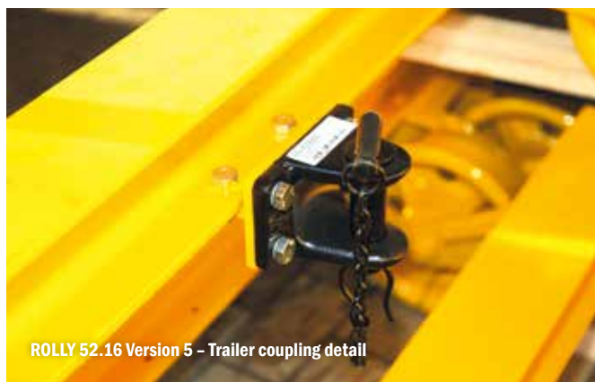
ROLLY 52.16 Version 5 - Trailer coupling detail