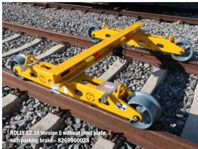
ROLLY 52.16 Version 5 without pivot plate, with parking brake - 8269900038