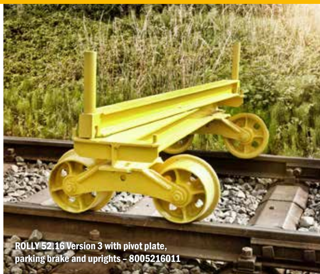
ROLLY 52.16 Version 3 with pivot plate, parking brake and uprights - 8005216011