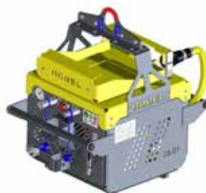
BLDC drive unit E3