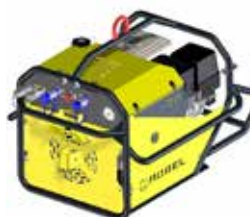
Honda GX270 drive unit