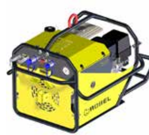
Honda GX270 drive unit