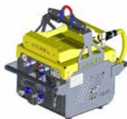
BLDC drive unit E 3