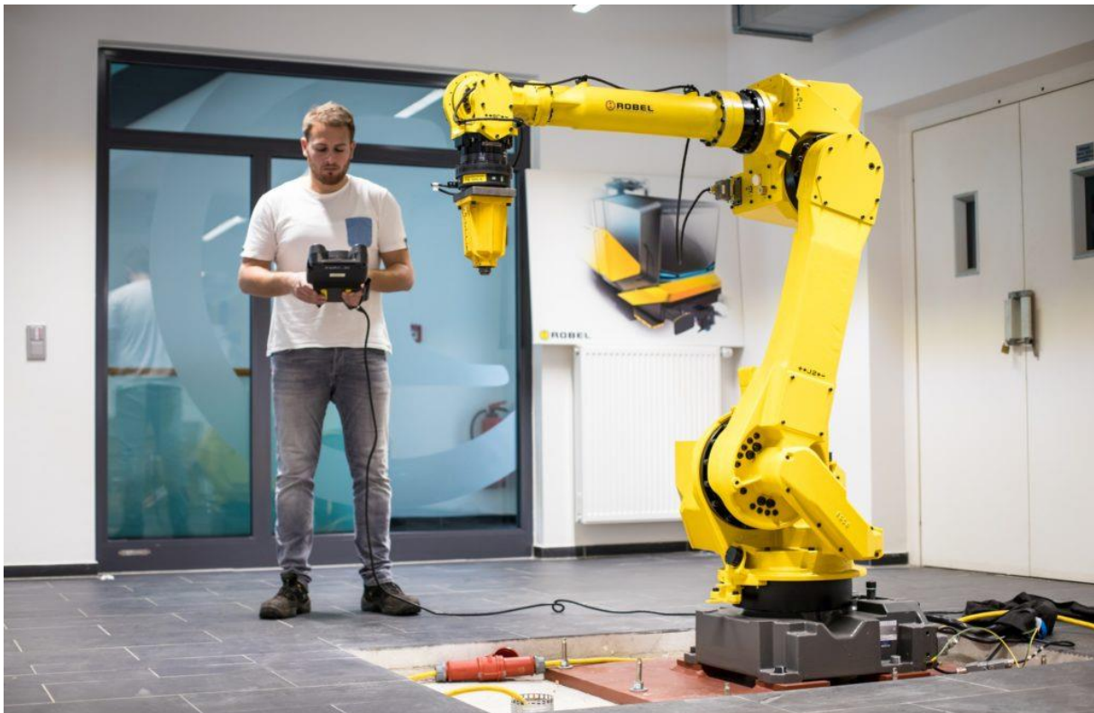
First laboratory tests of a track construction robot in the newly established Robel Technology Center in Freilassing, Germany

On the 17th September 2018 the World Economic Forum made the prediction that “Machines will do more tasks than Humans by 2025...” . According to this report, within the next 6 years, 52% of all working hours will be done by robots. As a result, productivity in the affected industries has the potential to increase significantly.